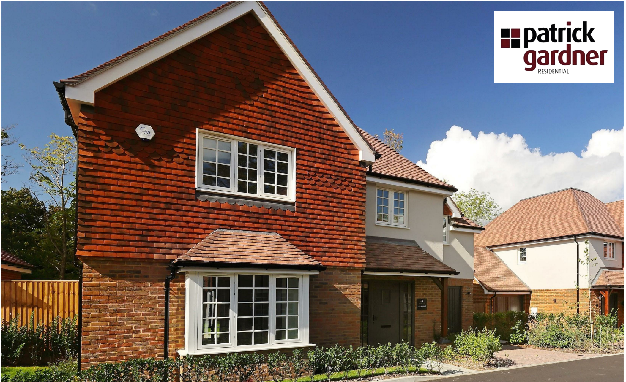
Plot 7 Cornerstones, Effingham, Surrey, KT24 5JR